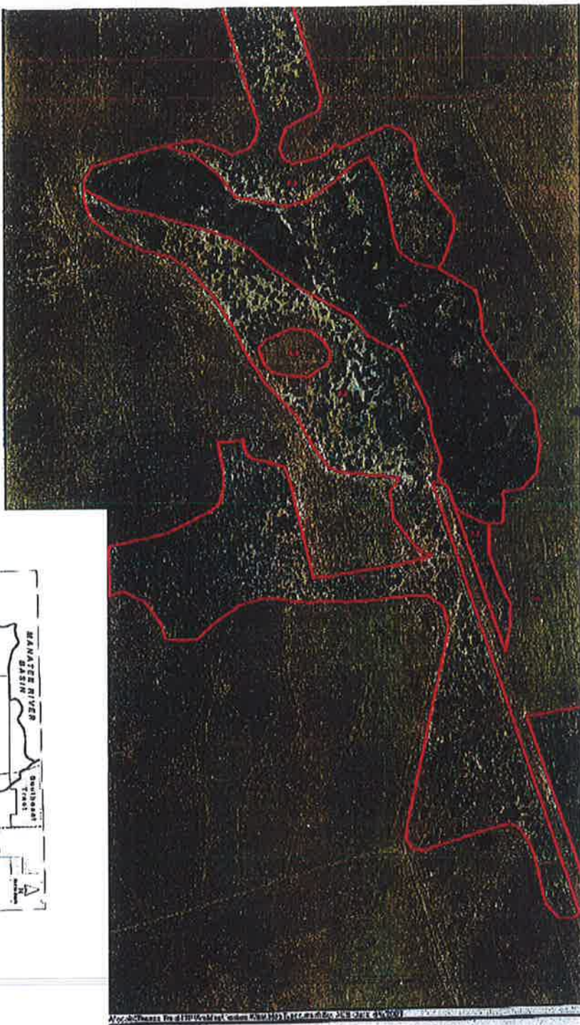
Texaco Tract Manatee and Hardee Counties, Florida